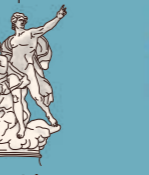
Fountain Helios and Selena